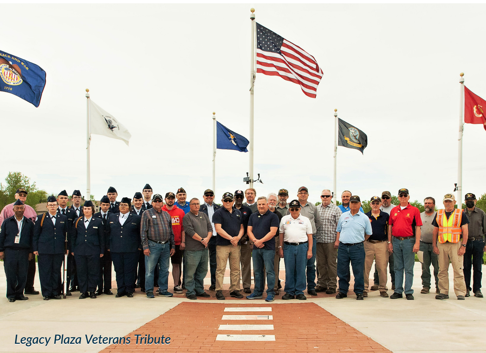
Legacy Plaza Veterans Tribute

INCLUDING GRAIN VALLEY PARKS & RECREATION ACTIVITY GUIDE!