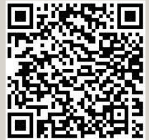
Application for Boards and Commissions

The Volunteers in Police Service (VIPS) is formed of graduates of the Citizens' Police Academy. VIPS assist in various police department operations including crowd control, special event implementation and administrative duties. The next Citizens' Police Academy will begin September 2021. For more information about the VIPS call 816-847-6250.