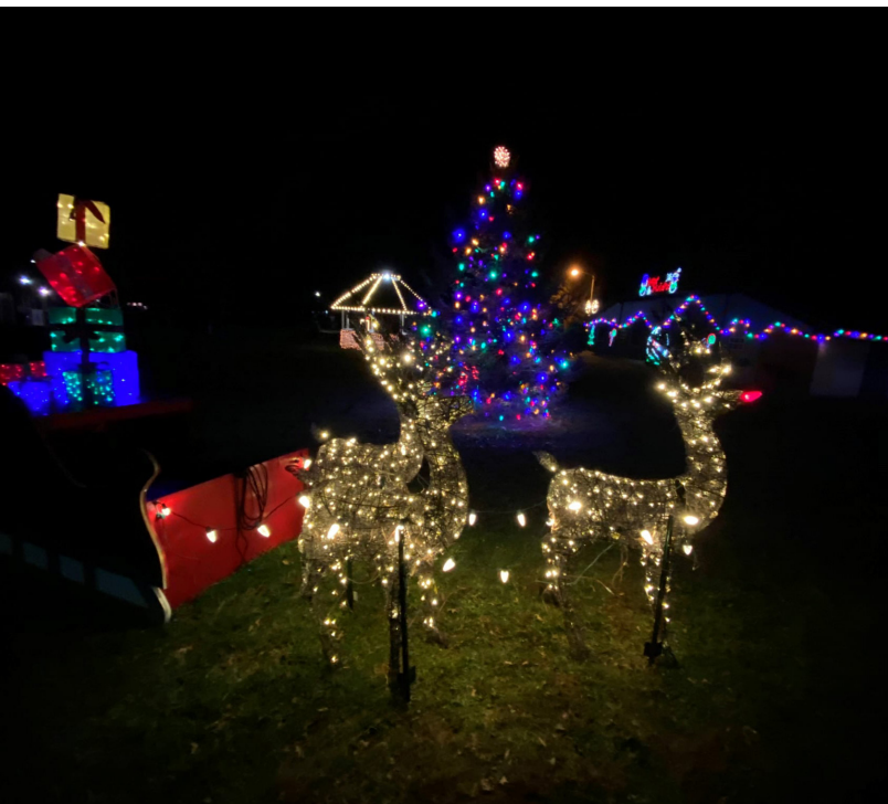
Santa's Sleigh will be at Armstrong Park November 27 through December 12

The mailbox will be situated next to Santa's sleigh with a winter scene, perfect for family photo ops! Labels to record information about each child who writes to Santa will be provided near the mailbox or you can include the child's name, mailing address and gift wish on the letter. Please print each child's information clearly. If using a label, please affix it on the envelope or on the back of the letter.