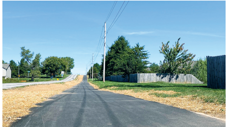
Dillingham Trail Trail

This trail was needed in order to create connectivity between the neighborhoods north and south of Duncan Road. The newest phase of the trail is approximately 2,000 feet of new asphalt which was added adjacent to Dillingham Road. This section of trail connects two existing trails from Persimmon Drive to Hedgewood Drive.