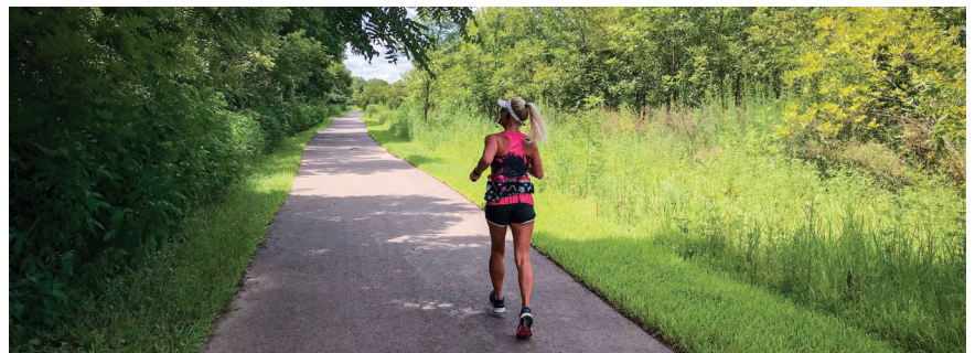
Blue Branch Creek Trail

Blue Branch Creek Trail provides a serene, wooded landscape with wildflowers aplenty during the warmer months of the year.