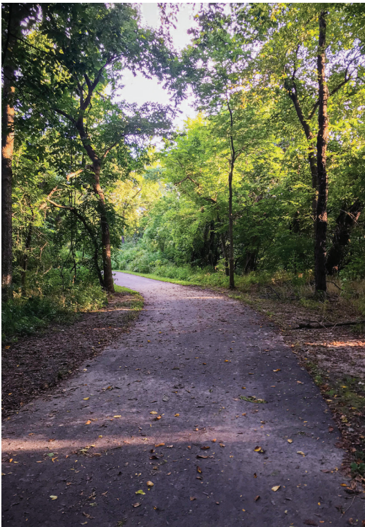
Blue Branch Creek Trail

Blue Branch Creek Trail provides a serene, wooded landscape with wildflowers aplenty during the warmer months of the year.